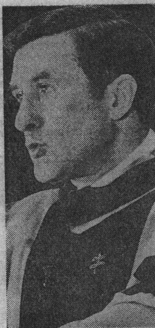
GRADUATES HEAR NAVY SECRETARY

One of the stars on hand was Debbie Reynolds, who had to go up to $200 to get the dress she wore in "How the West was Won."